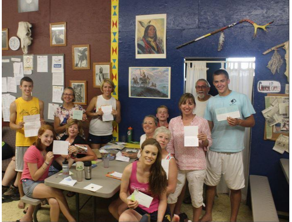
The Bethel mission team during prayer partner time